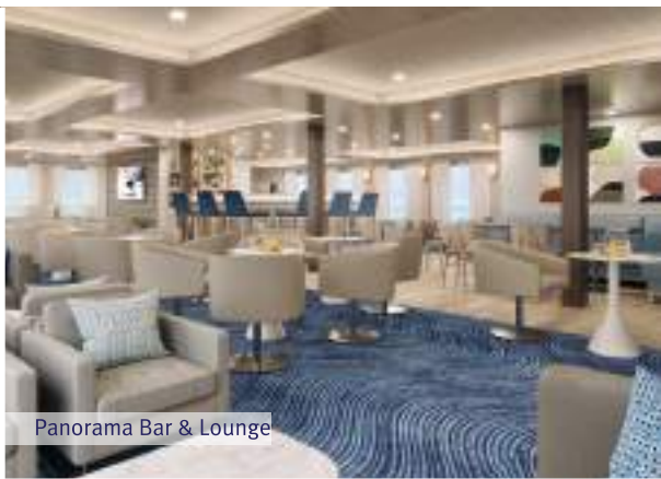
Panorama Bar & Lounge