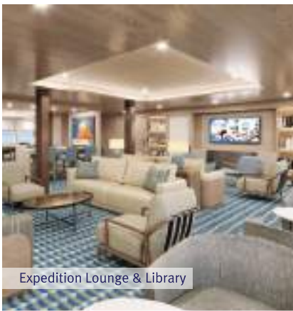
Expedition Lounge & Library