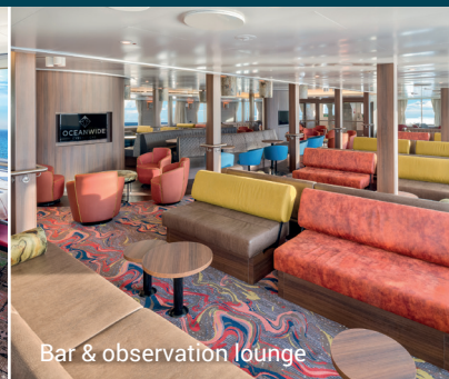
Bar & observation lounge