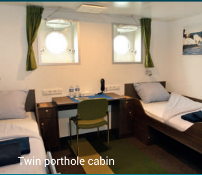
Twin porthole cabin