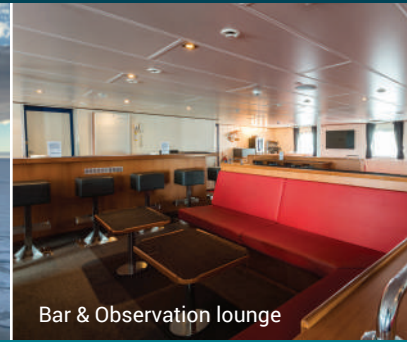
Bar & Observation lounge